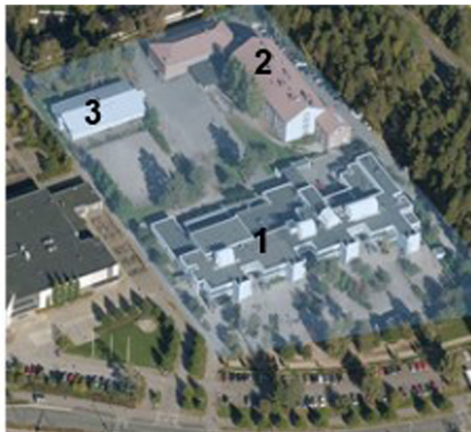
Figure 1. The case-campus is light-coloured and the numbered buildings are (1) the white building, (2) the brick building and (3) the pavilion